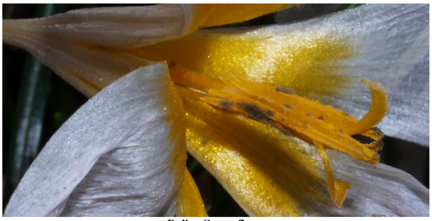
Fading Crocus flower

This is a Crocus caspius flower that is now past its best and starting to wither. I wanted to illustrate one of the difficulties you will experience in cold damp conditions and that is grey mould which in this flower is forming on the pollen. Removal of the dead flowers as soon as they collapse will help keep the mould from becoming a serious issue. At last now the rain has stopped and we are having some bright sunny days however with the clear skies comes hard frosts so most of the bulbs will grow more slowly now.