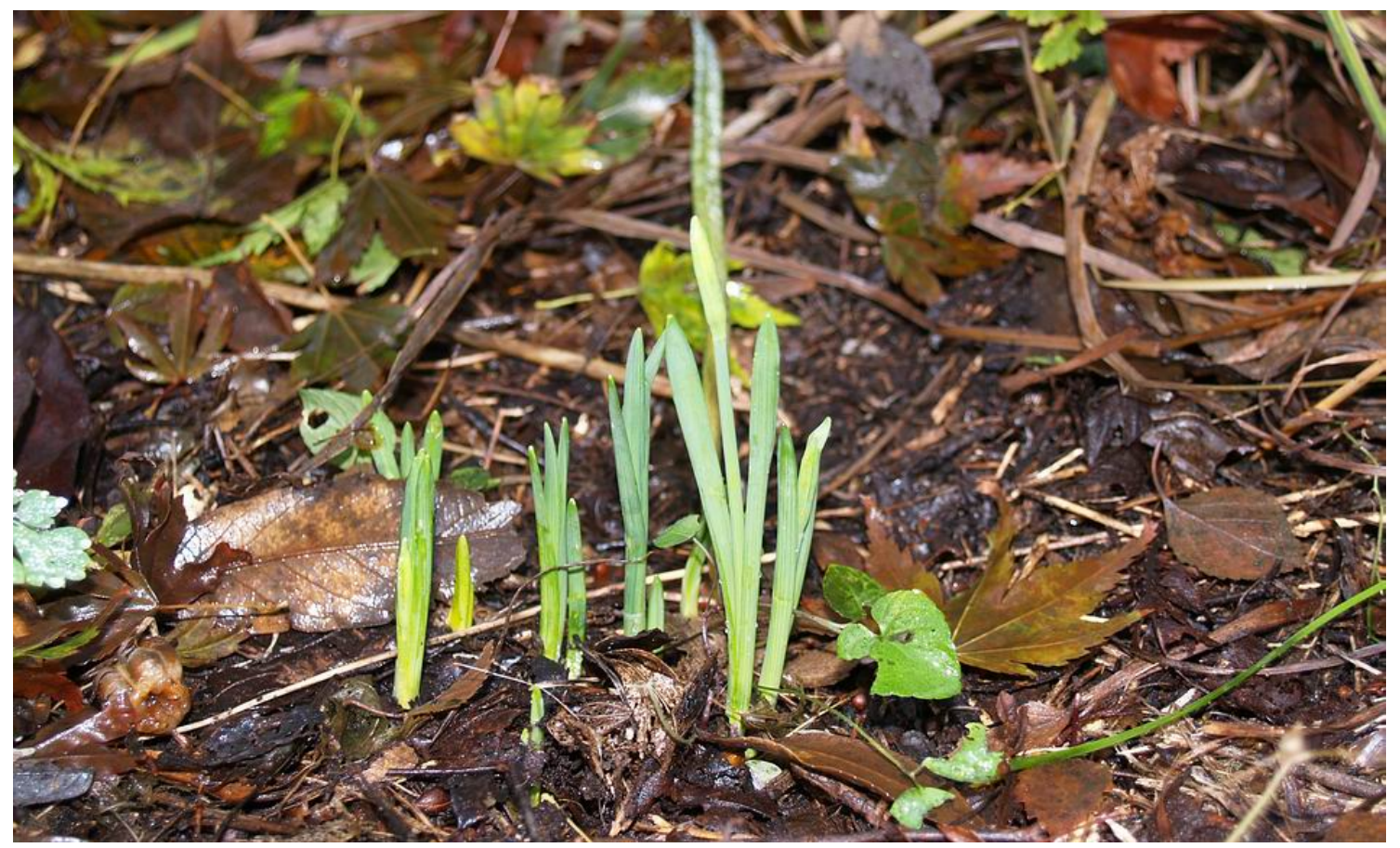
Narcissus 'Cedric Morris'

It is not just in the bulb houses that there are signs of Narcissus growth – out in the garden the leaves of many Narcissus bulbicodium are emerging and this group of Narcissus 'Cedric Morris' also has advanced flower buds.