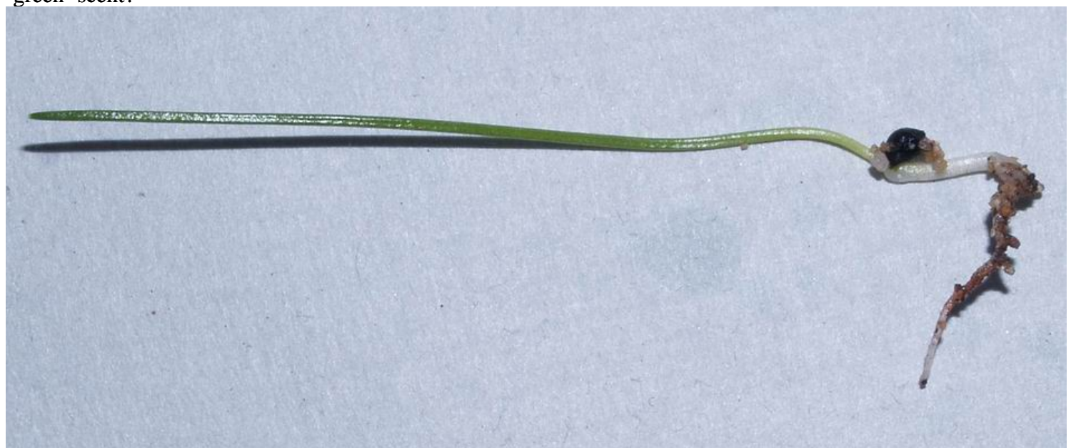
Narcissus seed germinating

so easy - I find it is the same with plants. There is often something about a flower, the way it opens or holds itself perhaps, that is difficult to quantify but is clearly recognisable. This is the case with Crocus niveus and Crocus hadriaticus. One feature that is defined and usually helps is that the leaves of Crocus hadriaticus are usually sheathed well above the ground by the bracts and prophyll as the picture above demonstrates. There is another important sense that helps in identification of the individual and that is scent. Perhaps it is not used in taxonomy very often because it can be very subjective and there is no clear scale to measure it against – although modern science has its methods and being a most important factor in attracting pollinators it is a major evolutionary dynamic. I find that Crocus hadriaticus has a strong sweet scent while Crocus niveus has only a faint slightly bitter scent that I describe as a 'green' scent and there is the problem. How many of you understand what I mean as a 'green' scent?