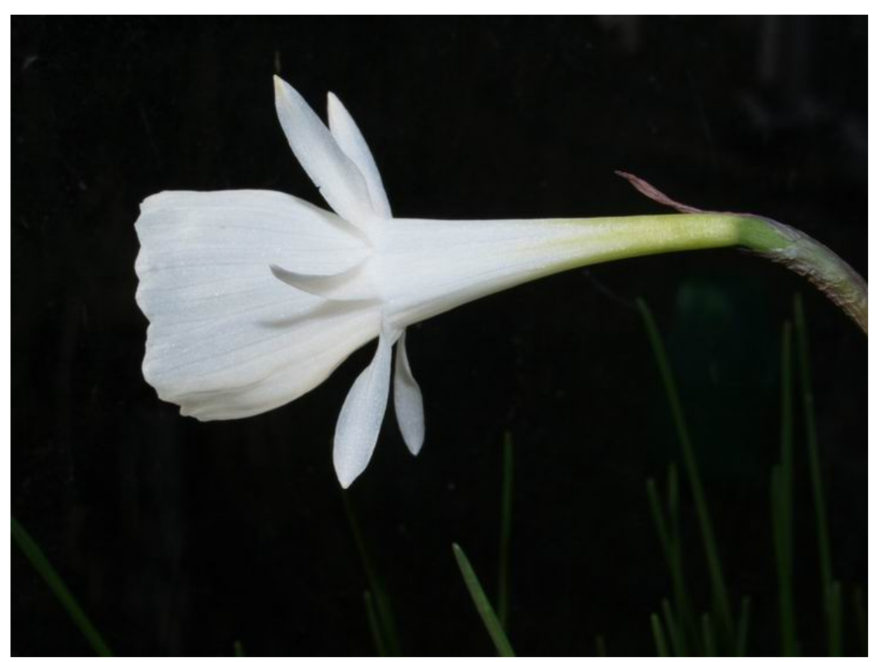
Narcissus cantabricus foliosus

One of the delights of growing bulbs is that no matter what time of year it is there are always different genera and species to give us interest. Now my interest is starting to switch from the Crocus as the autumn ones have peaked to the winter flowering Narcissus which like this Narcissus cantabricus foliosus are just starting to produce their flowers. It is now time to start to look carefully at the flowers and check the identity to ensure they are what the label says. Remember the more you study your flowers the more you will get a feel for the wee differences that separate them.