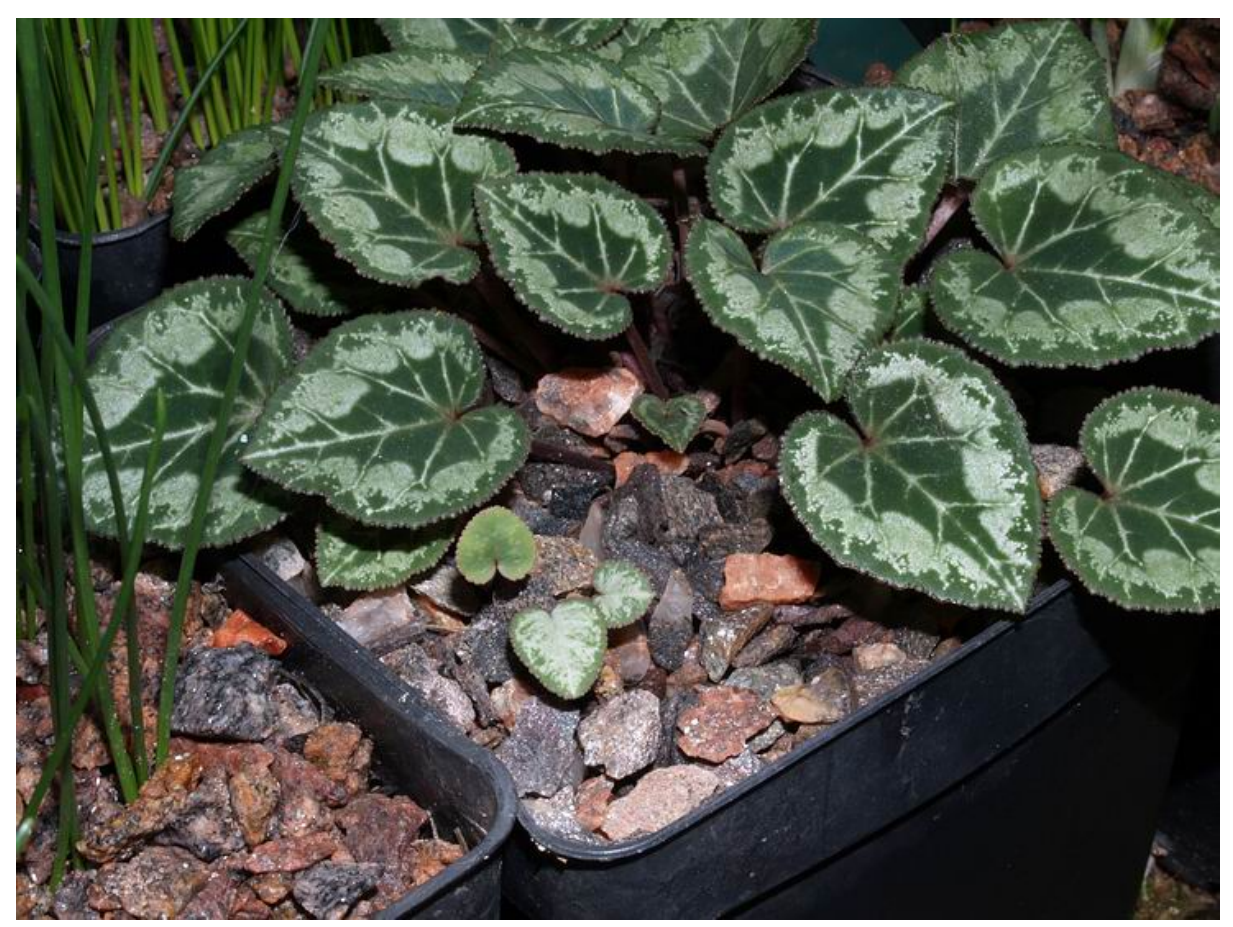
Cyclamen persicum leaves and seedlings

In the centre foreground of this picture you will see some small leaves that are the results of self sown seedlings - I must have missed collecting a seedpod from this Cyclamen persicum.